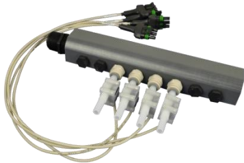
Flowmeters w/ John Guest fittings and manifold

With the Vanguard Visu-Flo, you can work with peace-of-mind knowing your liquid is being applied where you want it and at the rate you want.